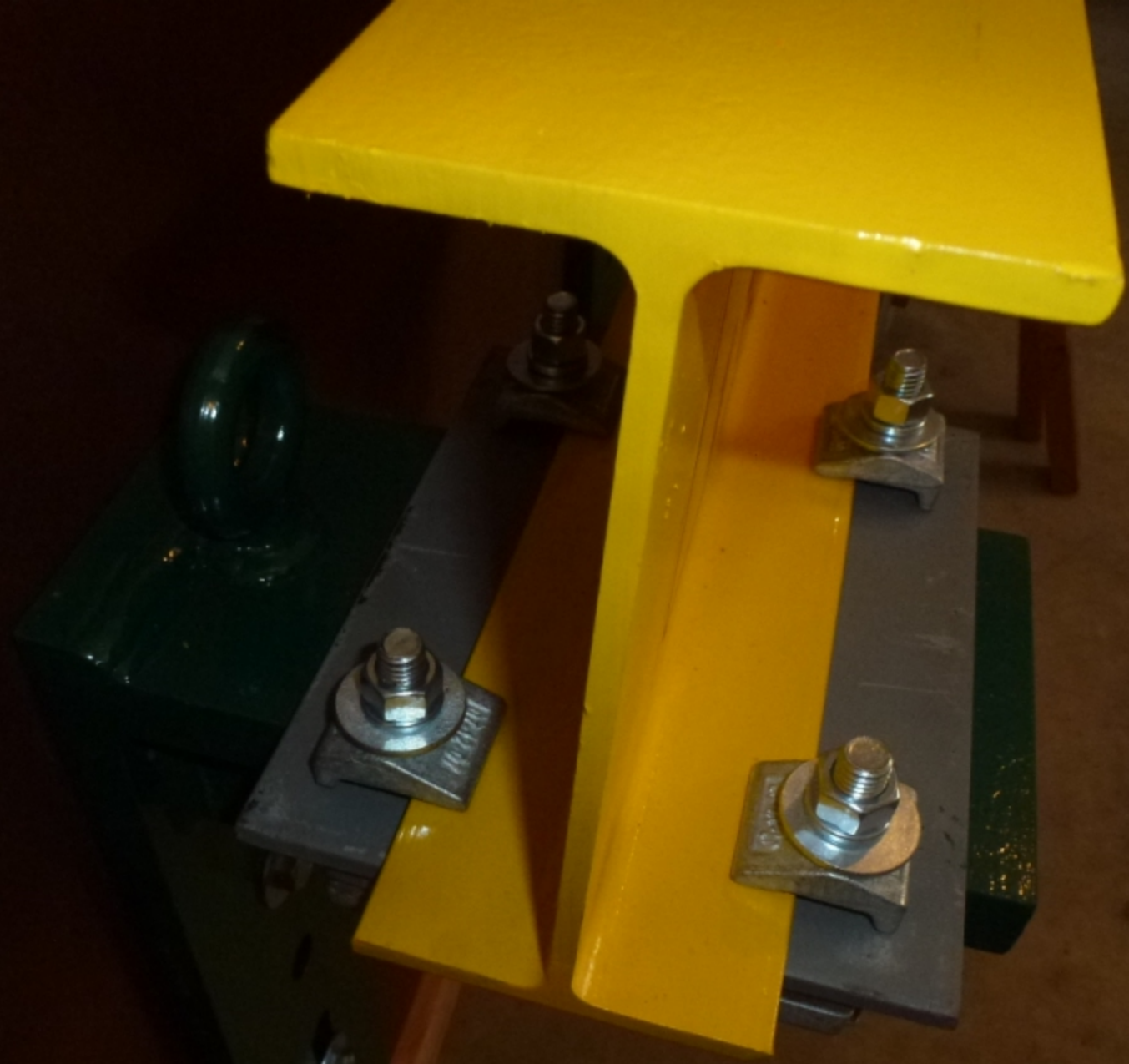
Shop Display- Structural Connection Detail