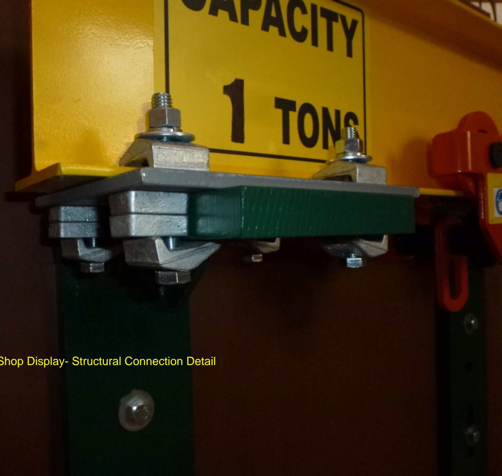
Shop Display- Structural Connection Detail