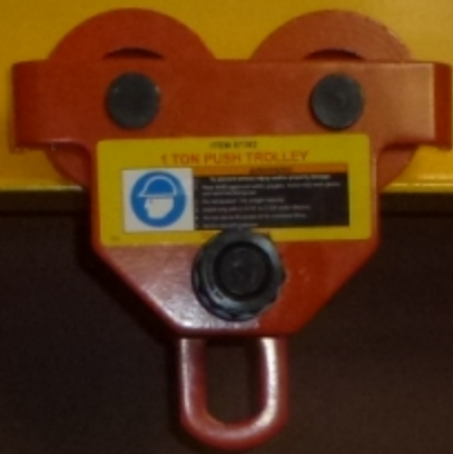
Mini Shop Display-Beam and Trolley