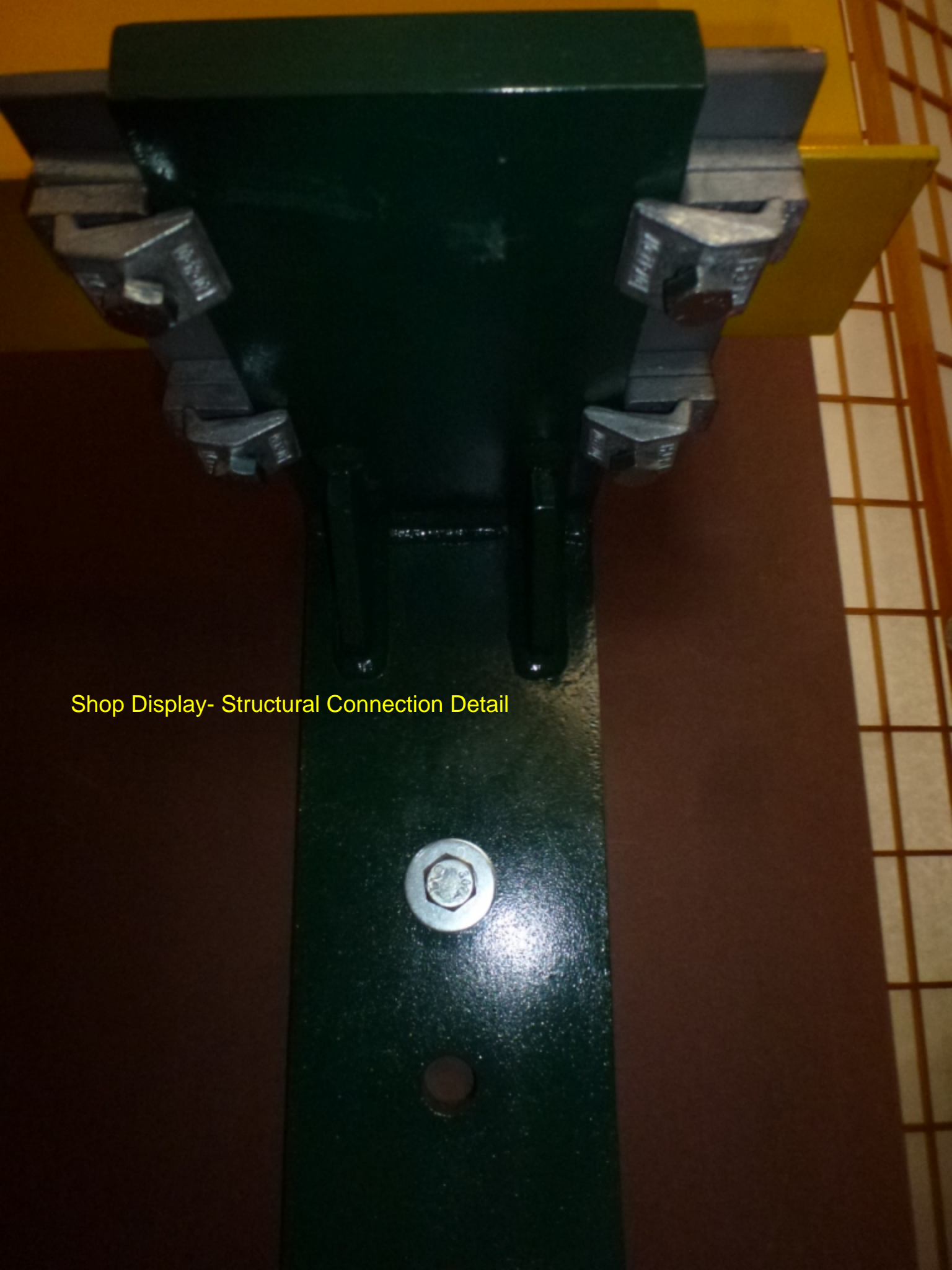
Shop Display- Structural Connection Detail