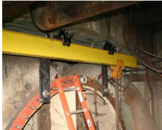
Beam on Bottom of Bracket for Round - Shaped Water Box Flanges